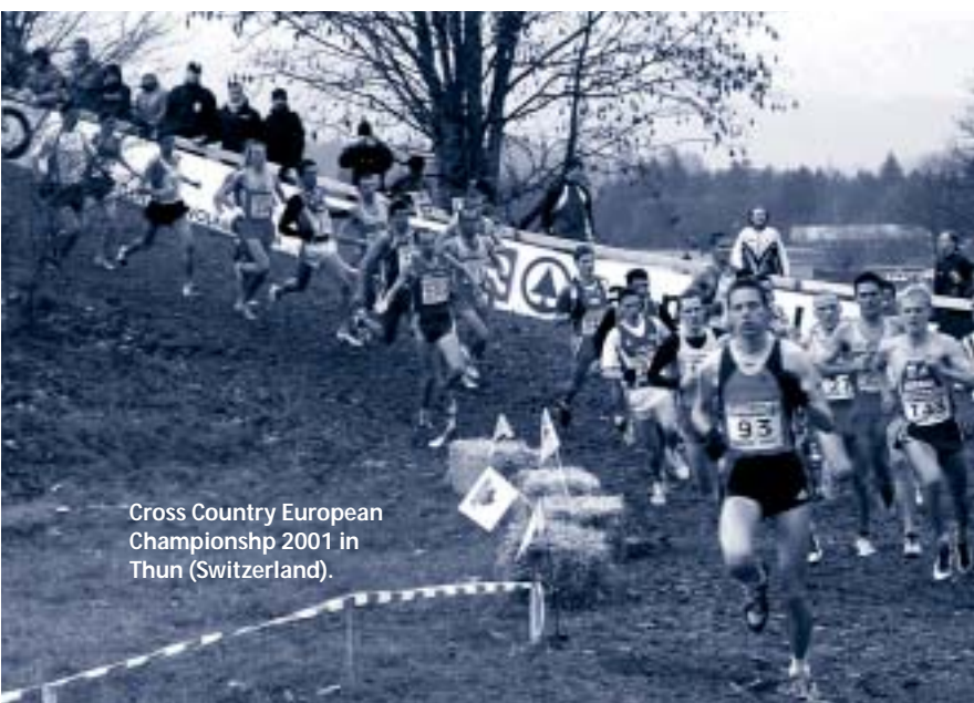
Cross Country European Championship 2001 in Thun (Switzerland).