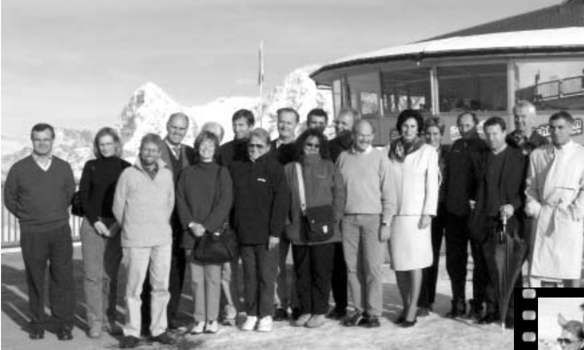
The EAA Council on top of the Schilthorn and in front of the famous Eiger, Mönch and Jungfrau.