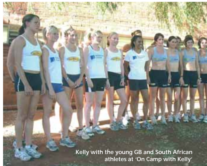
Kelly with the young GB and South African athletes at 'On Camp with Kelly'