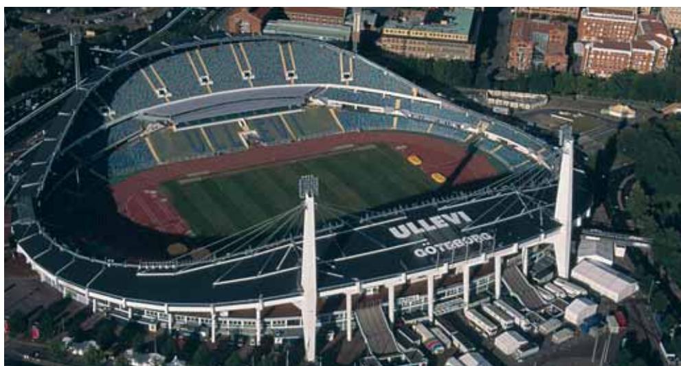
The Ullevi Stadium in Gothenburg, venue for the 2006 European Athletics Championships

With the aim of stepping up the EAA's fight against doping, the Council decided to assign Doping Control Delegates to six additional European Cup events. Previously, doping control activities at the European Cup First and Second League, European Cup Combined Events, European Cup Winter Throwing, European Cup