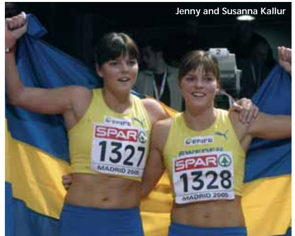
Jenny and Susanna Kallur